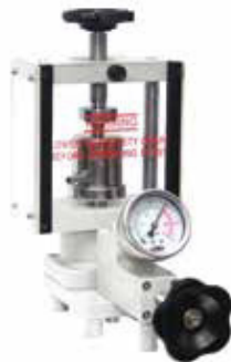
Hydraulic Press MODEL : HP-Mini