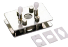
Universal Liquid Cell Holder