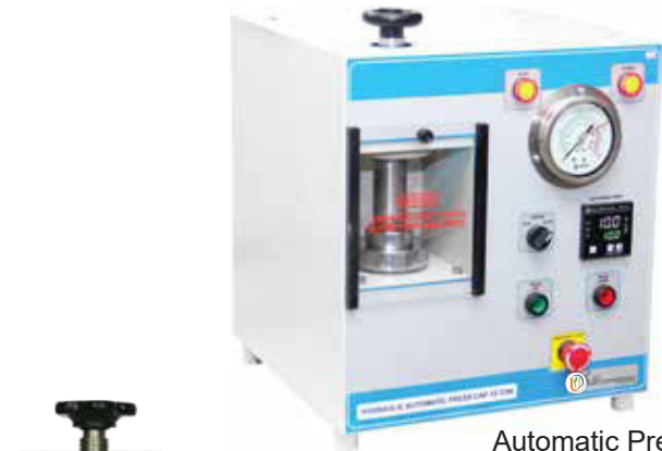
Automatic Press MODEL : HP-15TA