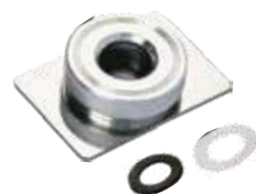
Mull Cell Holder

The cell holder is used to mount circular as well as rectangular windows & it can be used as Demountable Cell & Fixed Thickness Cell using dierent spacers supplied along with teon washers of dierent sizes. Mull cell holder is used to mount circular window & for mull samples. Cell holder are supplied along with assorted spaces of size 0.1 mm, 0.2 mm, 0.5 mm & 1 mm.