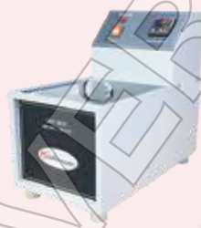
MODEL : DB-02N