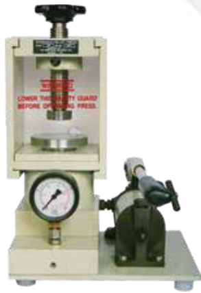
Manual Press MODEL : HP-15TM