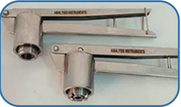
Crimper / Decrimper (Manual- SS)