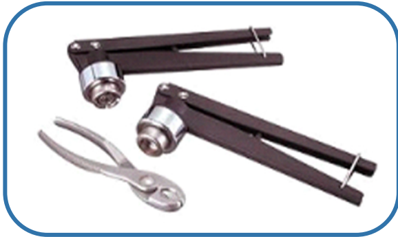
Crimper / Decrimper (Manual- MS)