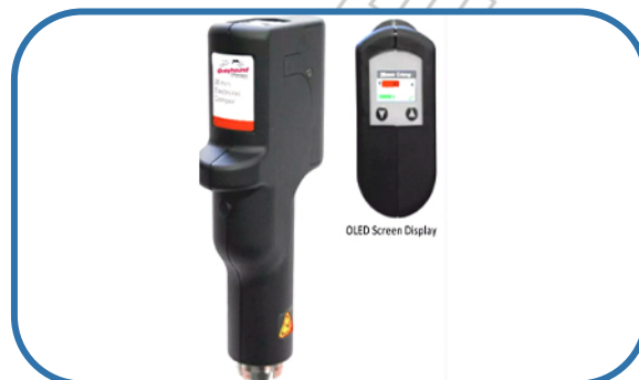
Crimper / Decrimper (Automatic)